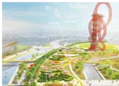
Queen Elizabeth Olympic Park