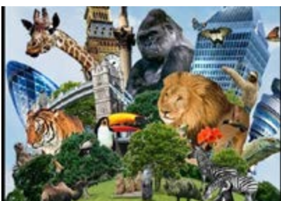
ZSL London Zoo