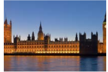
The Palace of Westminster