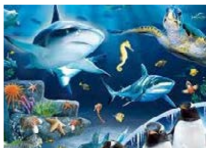
Sea Life London Aquarium