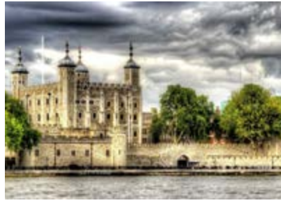
The Tower of London